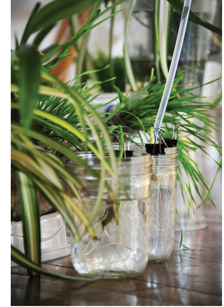
Figure 5: Photodotes II: Light Garden helped plants absorb solar energy in order to develop.

Beyond Zitofos and Photodotes , in the recent dual exhibition of Hans Haacke and Otto Piene at MIT List Visual Arts Center, there is an evident relationship between space and the immaterial, form and natural or/and artificial invisible forces.